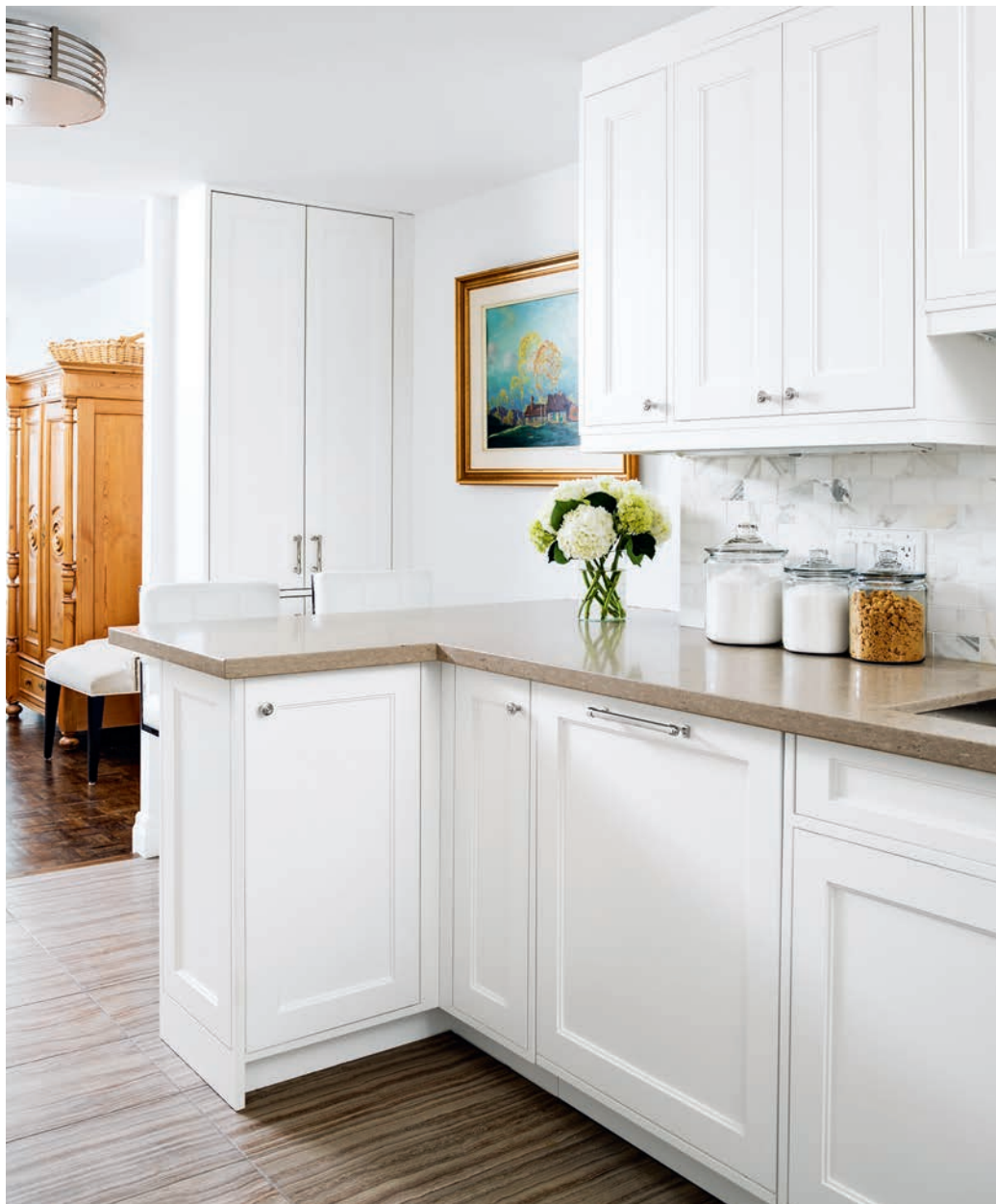
ABOVE A tall, shallow pantry directly behind the breakfast bar houses canned goods. The Calacatta marble backsplash with hints of cocoa complements the quartz countertops and highly striated porcelain-tiled floor. The painting by Canadian artist Graham Noble Norwell adds some colour.